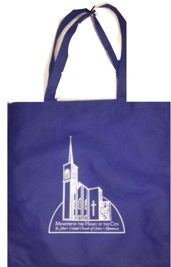
St. John's Bags