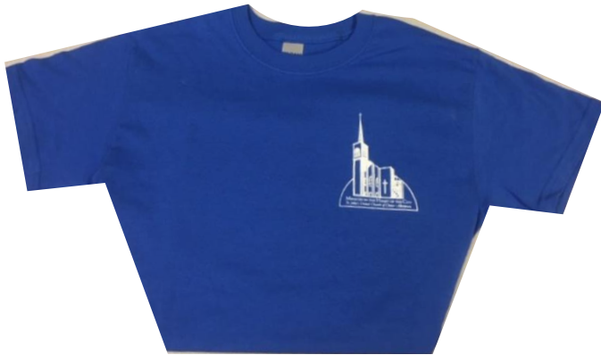
St. John's UCC Short Sleeve T-Shirts