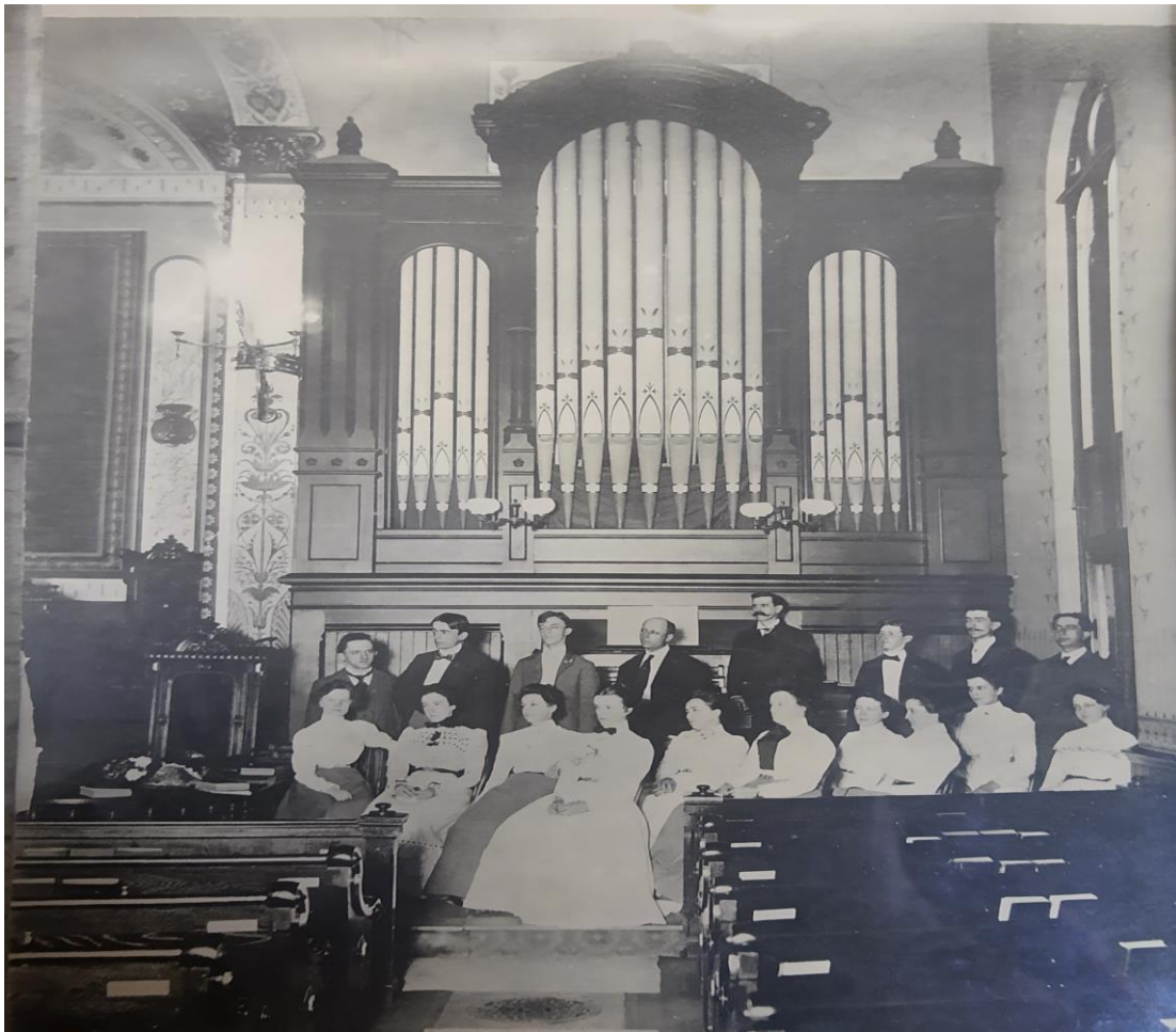
St. John's Organ and Choir, 1900

2 Kings 2:1-2, 6-14; 1 Kings 19:15-16, 19-21, Galatians 5:1, 13-25; Luke 9:51-62